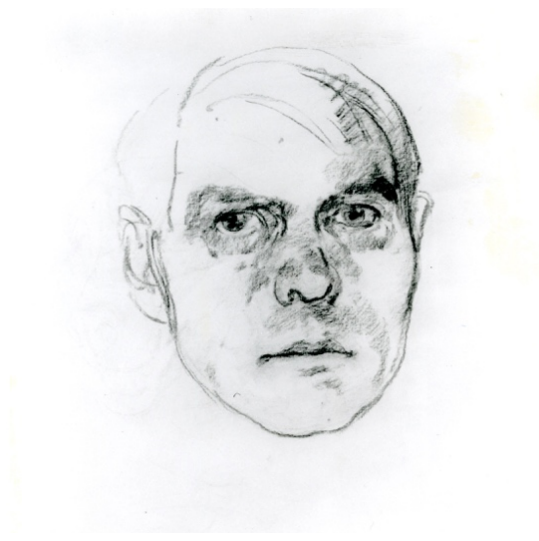
Self-Portrait Head Charcoal on paper, 13 3/4 x 13 3/4 inches Executed in August 1979 Y-252/ DLA-6329