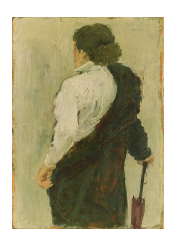
The Fur Collared Coat Oil on wood, 12 1/2 x 9 inches Painted about 1967 Y-80 / DLA-6322