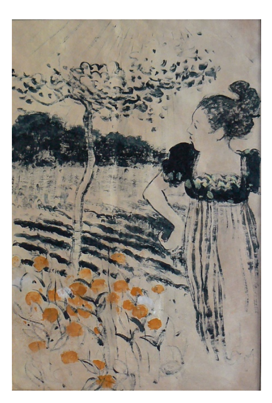
Woman in Garden Acrylic on tan paper, 20 7/16 x 13 3/4 inches (sight) Executed about 1970 Y-153 / DLA-6325