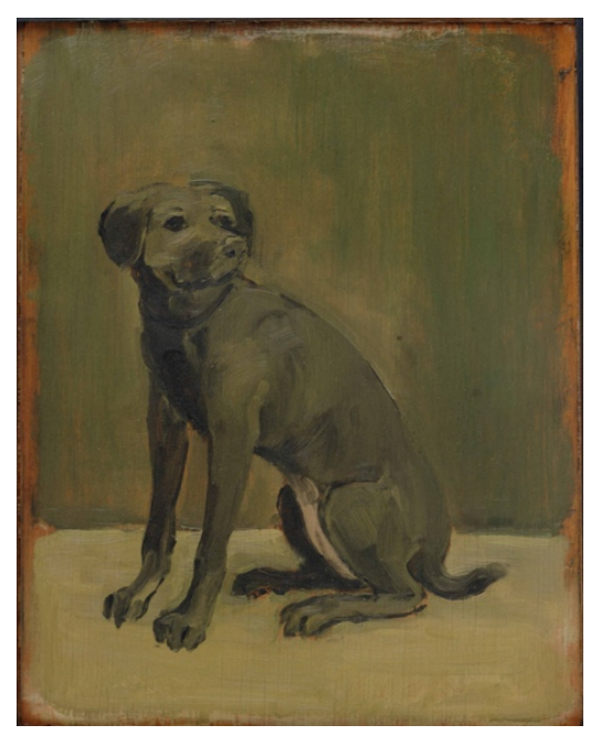
Seated Dog Oil on wood, 12 x 9 1/2 inches Painted about 1967 Y-81 / DLA-6323