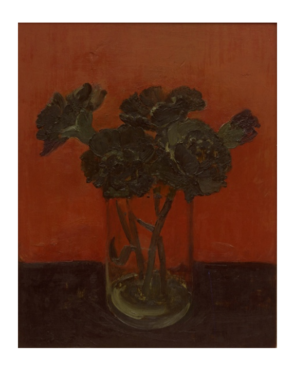
Green Flowers in Glass Jar Oil on panel, 13 x 10 7/16 inches Painted circa 1968 Y-98 / DLA-6324