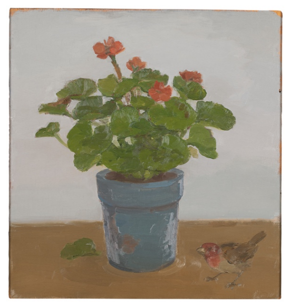
Geranium in Blue Pot with Fallen Leaf and Bird Oil on wood panel, 18 x 16 15/16 inches Painted in June 1982 Y-286/ DLA-6330