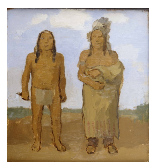
Two Indians in a Landscape Oil on masonite, 10 3/4 x 10 inches Painted in 1978 Y-238 / DLA-6328