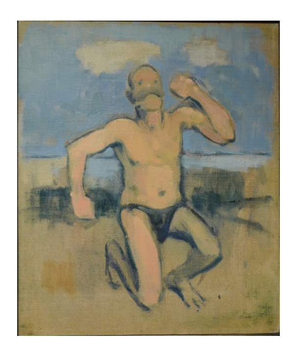
Kneeling Man on Beach Oil on canvas, 12 x 10 inches Executed in 1973 Y-180/ DLA-6326