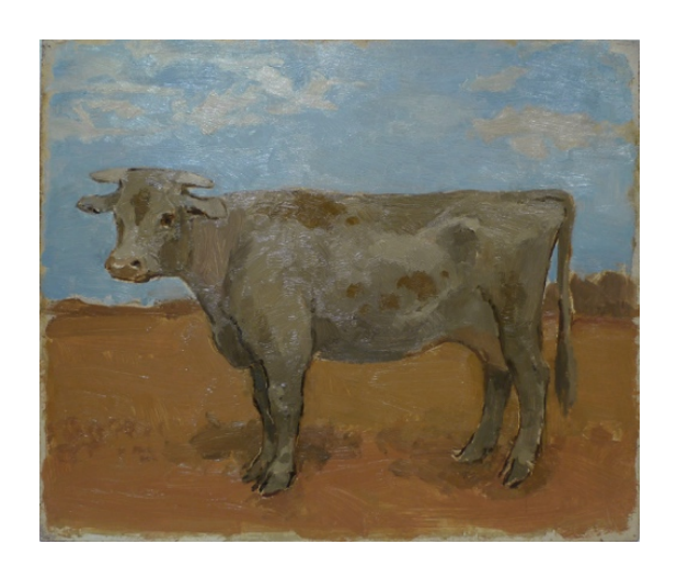
Cow in Landscape Oil on masonite, 9 15/16 x 11 15/16 inches Painted in October 1977 Y-206 / DLA-6327