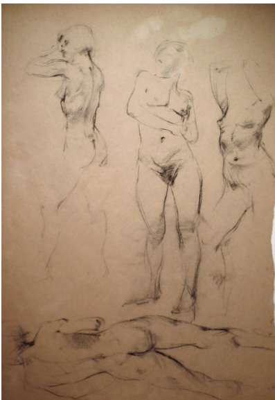
One Nude, Four Studies

Charcoal on tan paper, 21 11/16 x 15 1/16 inches