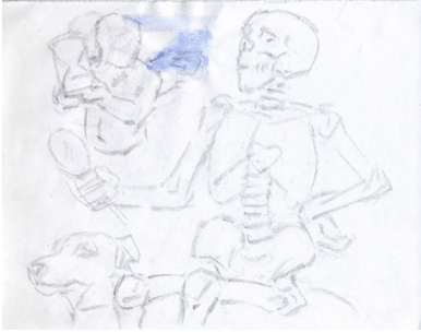
Head of Dog, Figure with Hourglass, and Skeleton Holding Mirror Graphite pencil and watercolor on paper, 8 1/8 x 10 1/2 inches (sight)